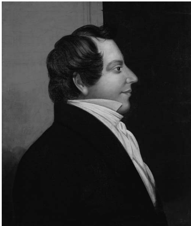
1. A sketch of Joseph Smith by Sutcliffe Maudsley, 1843.

anti-Mormon rage rose to fever pitch. Nearby editors called for the expulsion of the Mormons and threatened Smith's life. When the Mormon dissenters published a protest paper, the Nauvoo Expositor , in May 1844, the city council, fearing it would spark another attack from the Mormons' outside antagonists, closed the paper.