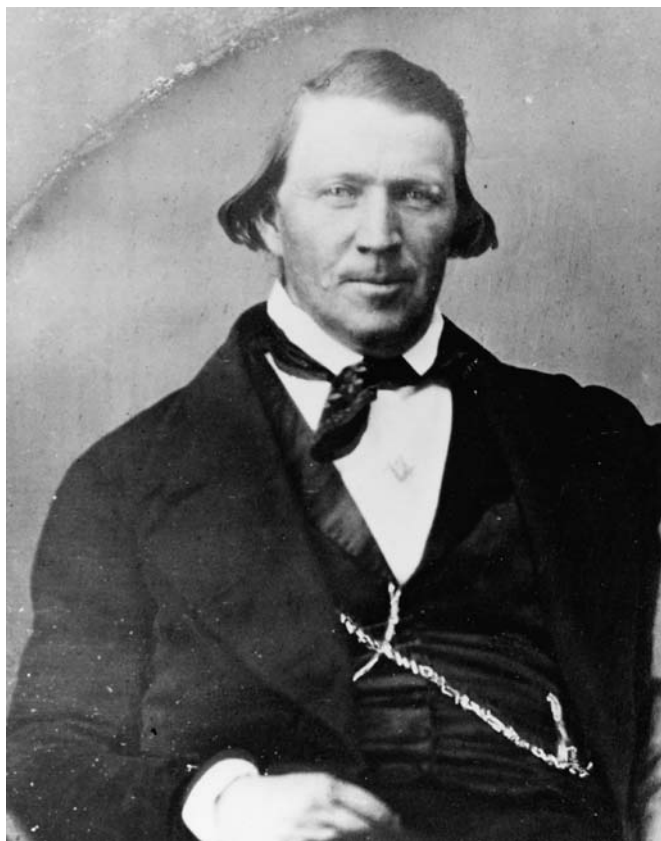
8. Brigham Young, 1851.

congregation was asked to vote, they raised their hands for the Apostles. A month later Rigdon was still asserting his superiority to the Twelve and was excommunicated. The following spring he organized his own church with its own apostles and prophet. Ignoring his other rivals, Young took charge of the main body of the church as it prepared for its western exodus.