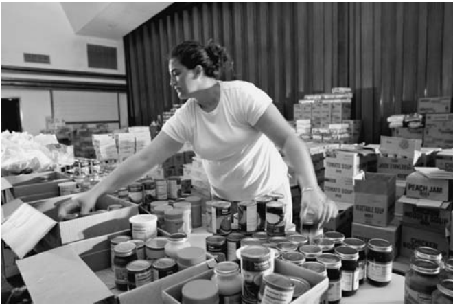
4. In 2005, the Church sent food packages from the supplies in its storehouses to victims of Hurricane Katrina.

the tsunami victims around the Indian Ocean in 2004 and to families hurt by mudslides in Honduras in 1998. In addition to the official programs, thousands of Mormons are involved in private philanthropic organizations for sending doctors to deprived areas, helping to build water systems in African villages, and teaching English in emerging nations. Mormons have been especially attracted to the microcredit movement, granting small loans to hardworking poor people to develop their own small businesses. This combination of charity and self-help appeals to Mormons because it reflects the church's preference for teaching self-sufficiency over outright handouts. Brigham Young University has become a major academic center for the microcredit movement.