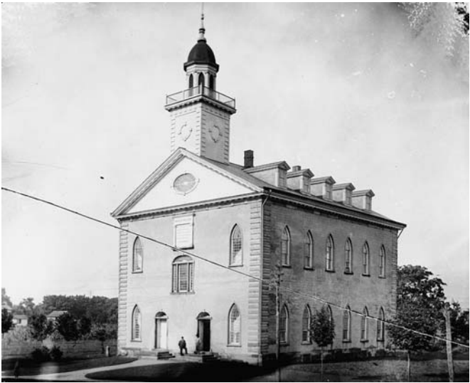
6. The temple in Kirtland, Ohio, completed in 1836 and still standing

Freemasonry, women were included as full participants. The ceremony dramatically reenacted the Christian story of the Fall and the progressive return to God through the redemption of Christ and the acceptance of covenants. As part of the temple ceremony, Mormons were clothed in a holy garment inspired by the one Aaron wore in Exodus as part of his sanctification. Today Mormons wear these garments under their street clothes as a reminder of their covenants.