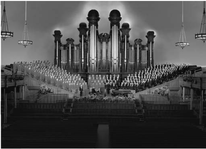
11. The 360-voice Mormon Tabernacle Choir has been broadcasting Music and the Spoken Word since 1929.