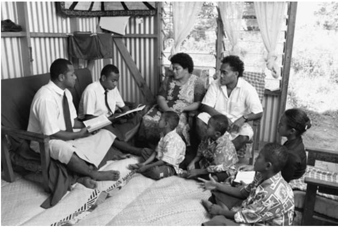
5. Clad in trademark white shirts, a pair of young missionaries visits a family in the South Pacific.

into the round of church service that fills Latter-day Saint lives. The missions are the training ground for the next generation of Mormon leaders.