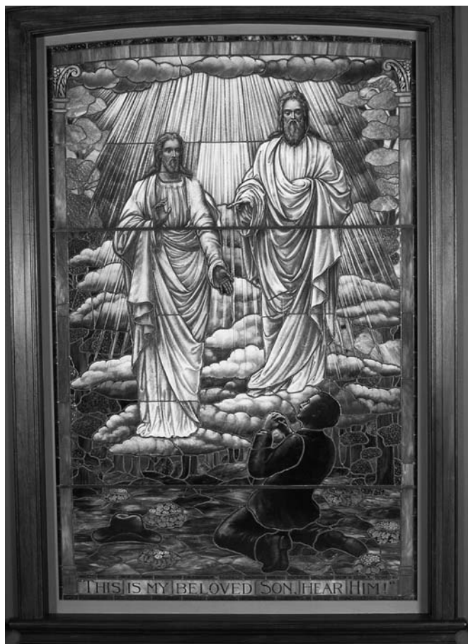
2. A stained glass window depiction of Joseph Smith's First Vision, installed in the Adams Ward, Los Angeles, in the early twentieth century.

Rather than doubting his vision, however, Smith lost confidence in the clergy and the churches and chose to live by his own lights. He put his own revelations above the judgment of the learned ministry. In this decision, Mormons see the precedent for the principle governing